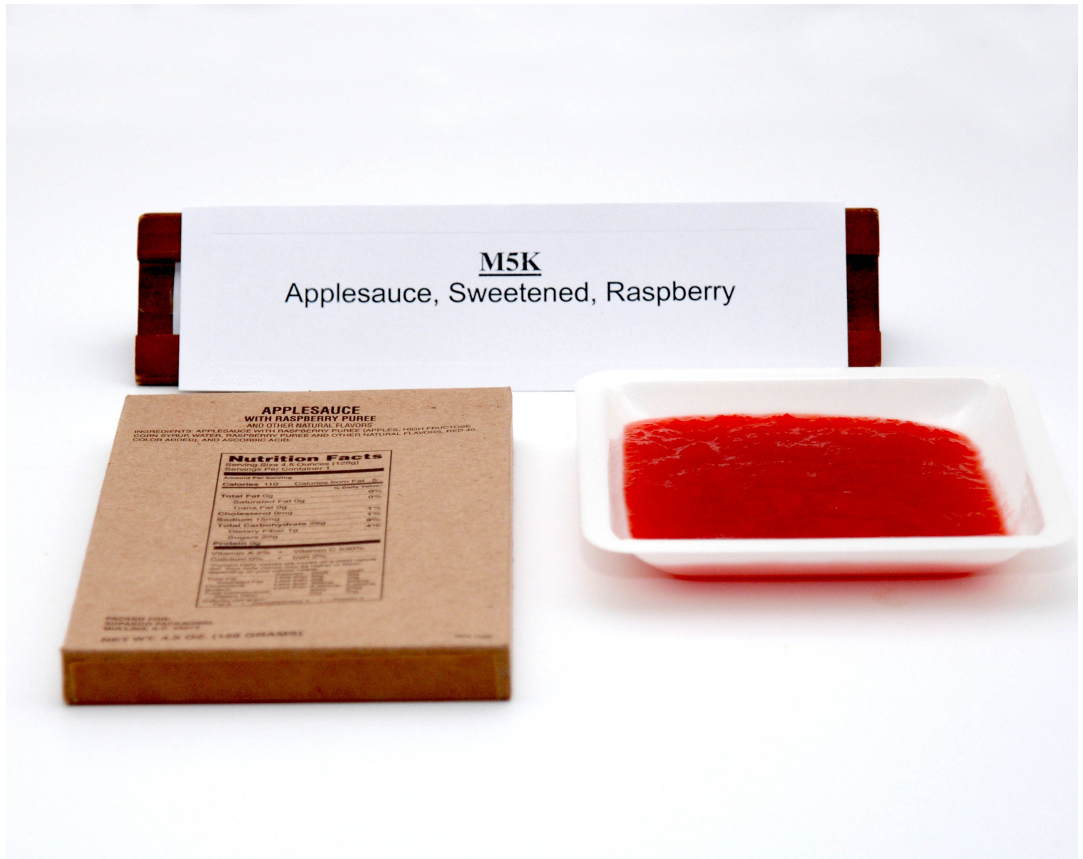
IMAGE OF NEW RASPBERRY APPLESAUCE